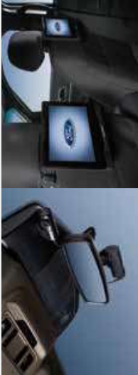
Dash cam systems 2