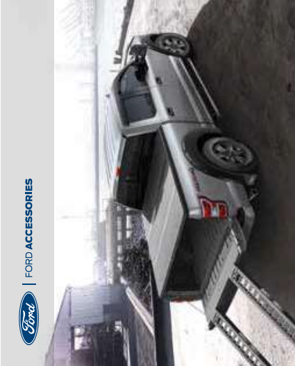
XLT SuperCrew® 4x4 in Iconic Silver accessorized with a chrome exhaust tip, premium flat splash guards with stainless steel inserts, step bars, stowable load ramps, spray-in bedliner, hard-folding tonneau cover, side window deflectors, fender flares, rear wheel-well liners, trailer tow mirrors and hood deflector