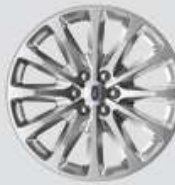
22" Polished Aluminum

Twin-panel moonroof. Leather-wrapped center console lid with unique VIN plate, SuperCrew 4x4, Agate Black. Available equipment.